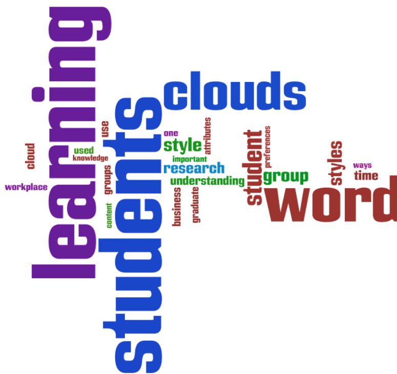
Figure 1. Wordle word cloud of this article.

Key words: accounting education, deep learning, graduate attributes, Kolb's learning styles inventory, motivation, workplace learning, word clouds.